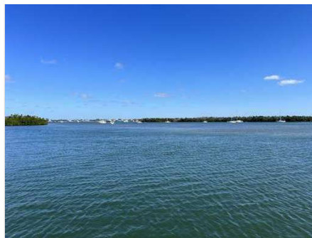
Lemon Bay South of Beach Rd Bridge