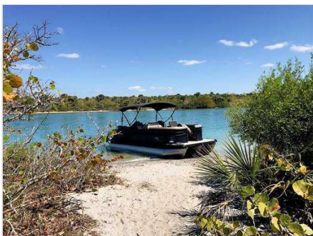
Nearby Petersons Cut (name of water)