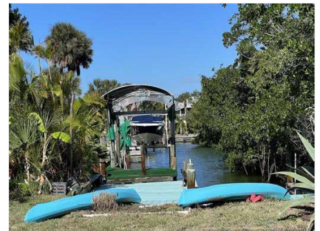
Relax! You've earned it