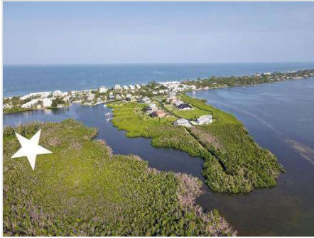
48 Acres / 1.5 Buildable