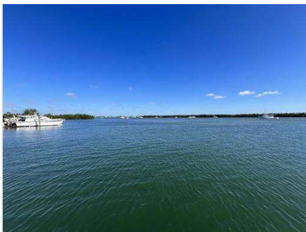
Lemon Bay South of Beach Rd Bridge