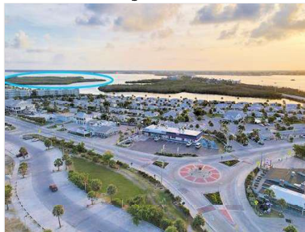
8 Hot Spots Nearby