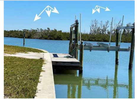
Southeast side looking Northwest