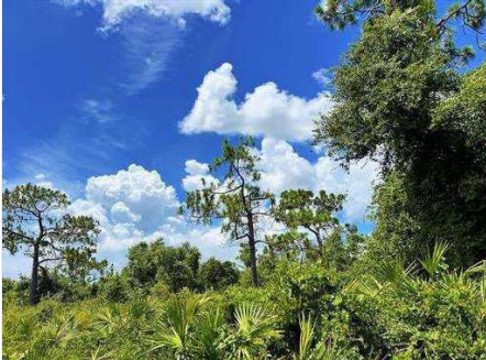
5700 Blackjack Ct S - Exterior of Lot