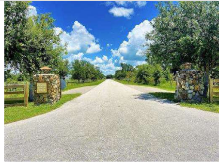
Prairie Creek West Entrance